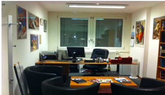
New GCF Office – Headquarters Geneva

The GCF Secretariat's office is located at the World Council of Churches complex, a well-located facility that accommodates various types of NGOs and IOs from health and religion-based institutions to public-private partnerships, similar to the GCF Foundation. The WCC building is situated near to Palais des Nations, the United Nations Office in Geneva, as well as to the famous InterContinental Hotel.