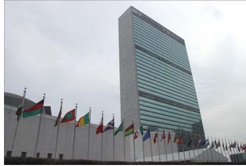
UN Headquarters in New York