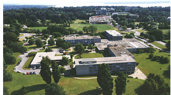
WCC complex in Geneva.

Our new office is also located near to the Global Hope Network International (GHNI) Headquarters in Geneva. GHNI is a major GCF partner in Switzerland and the mutual cooperation between the organizations creates valuable opportunities for both parties to get involved and participate in each other's endeavors in the most friendly and cooperative manner.