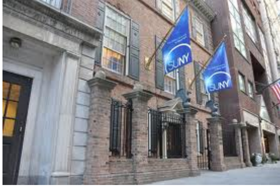
SUNY Global Center in New York